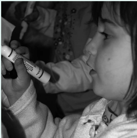
Child in Families Together Therapeutic Preschool