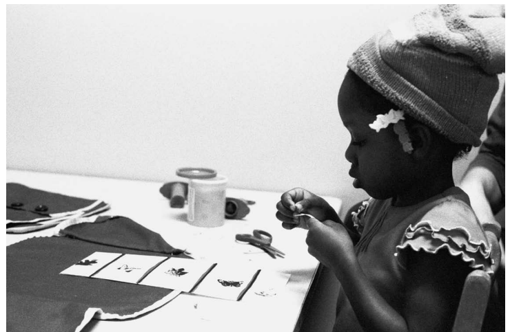
Child receiving occupational therapy