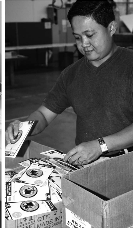
Lifetrack Resources clients contribute to our community